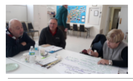
Leadership Retreat workshop