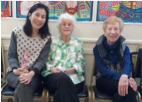
April 27 PW Spring into Reading Event