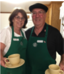
Pumpkin & Spice Barristas (That's the name on the name tags!)