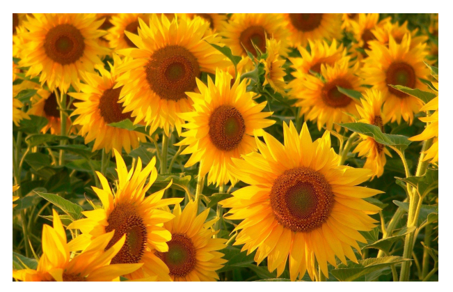
The national flower of Ukraine, the Sunflower